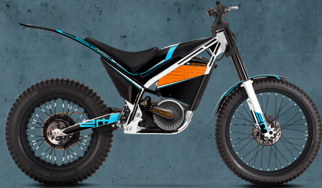
e SCAPE SPORT